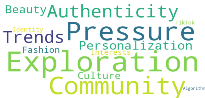
Figure 1. Word Cloud (at least 8 mentions).

Other relevant terms, such as "Authenticity," "Trends," and "Personalization," emphasize the participants' interest in staying true to themselves, keeping up with current movements, and tailoring experiences to their preferences. Themes like "Culture," "Fashion," and "Beauty" highlight the aesthetic and lifestyle influences, while "Algorithm" and "TikTok" point to the technological and social media aspects shaping their experiences.